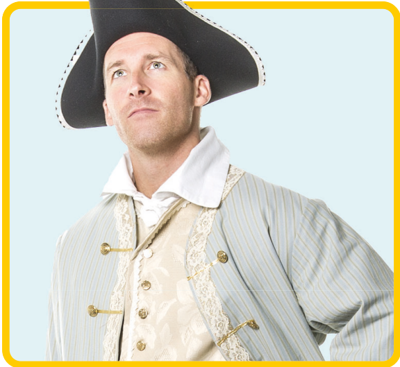
The History of Hats